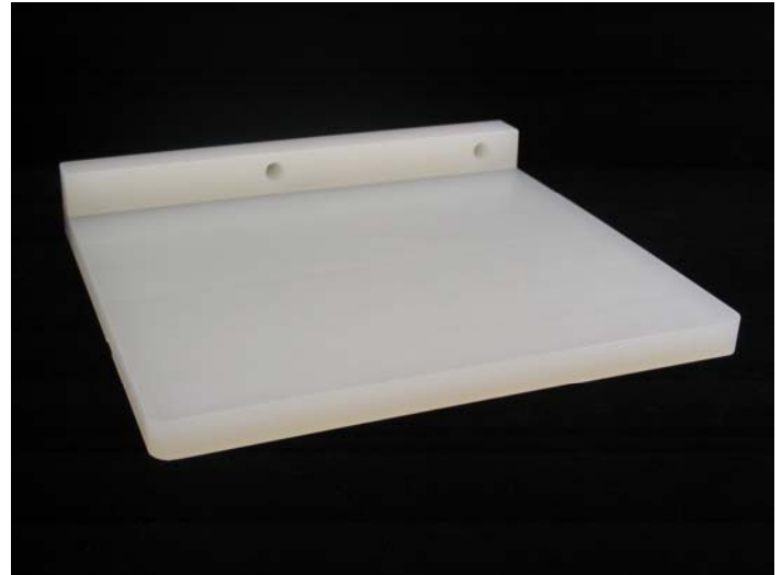
ES-2999-5421 Shelf for PE Elan with cassette torch