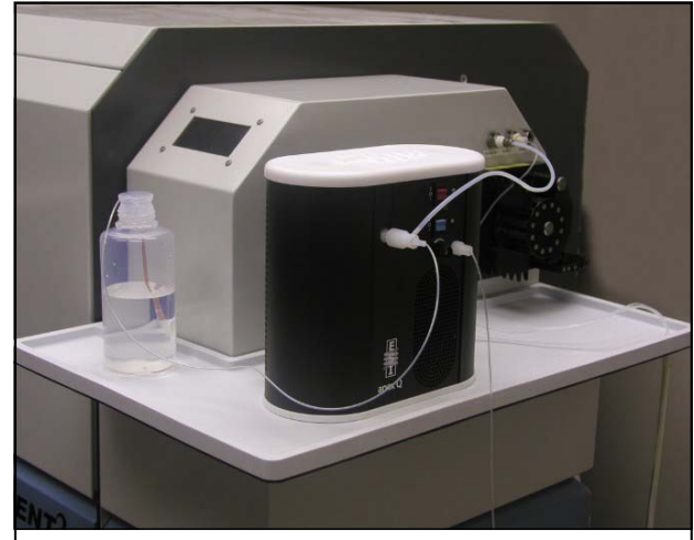
Greater work area makes using the Apex or other sample introduction systems more convenient.

Elemental Scientific Inc. 2440 Cuming St Omaha, NE 68131 USA www.elementalscientific.com