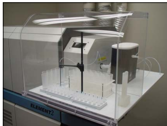
SC-E2 autosampler with clean enclosure attached