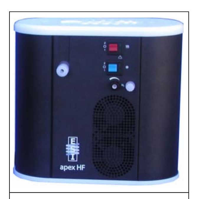
Apex HF sample inlet system

The Apex has proven to be a simple and reliable way to improve ICP-MS and ICP-AES sensitivity while minimizing contamination and mitigating interferences in a wide variety of sample matrices. Here the Apex HF sample introduction system was compared to the standard sample introduction system (SIS) to investigate whether sensitivity could be improved for a range of analytes in samples containing 1% total dissolved solids. All samples were analyzed using an axially viewed ICP-AES.